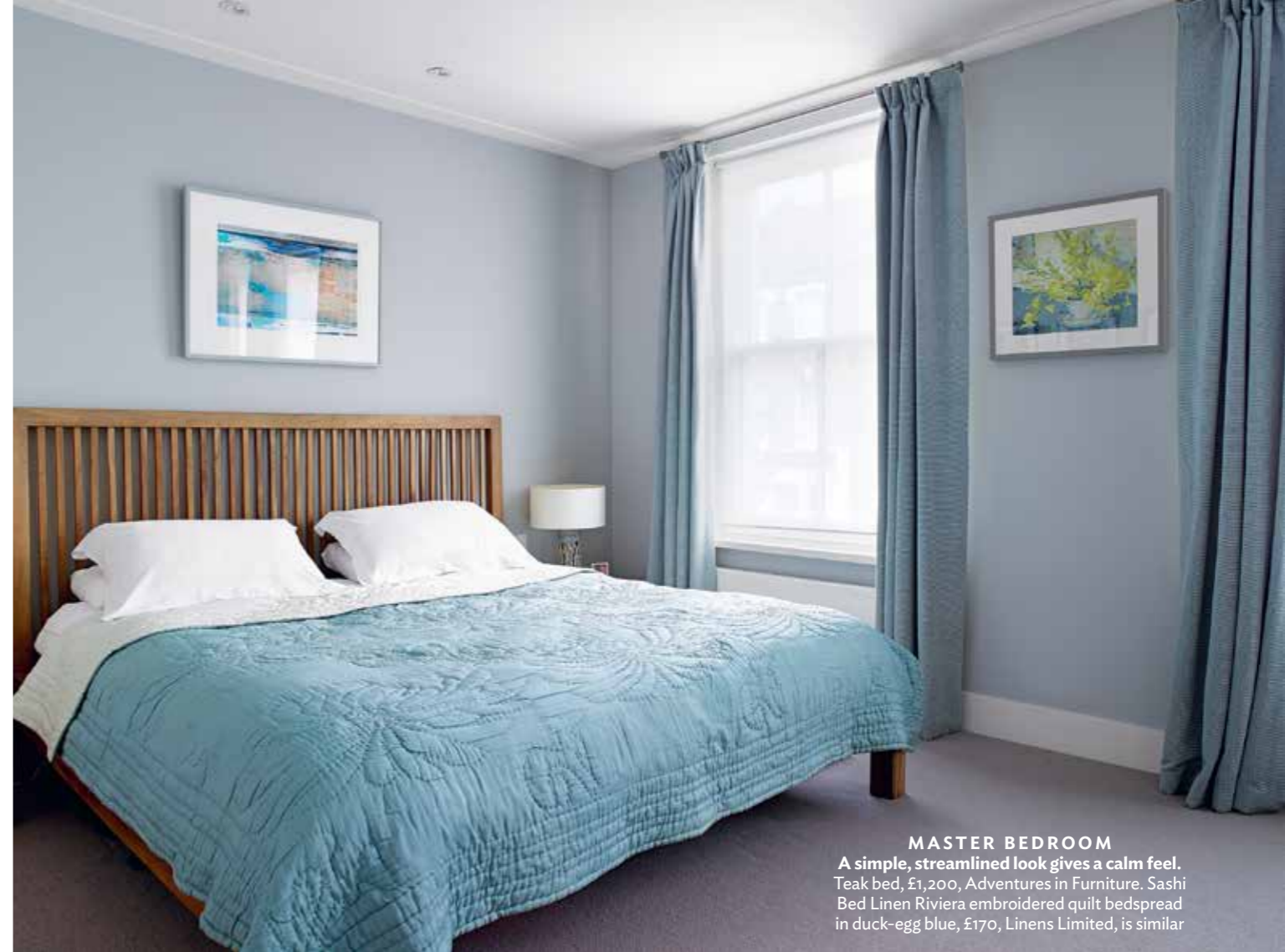
MASTER BEDROOM A simple, streamlined look gives a calm feel. Teak bed, £1,200, Adventures in Furniture. Sashi Bed Linen Riviera embroidered quilt bedspread in duck-egg blue, £170, Linens Limited, is similar

By reconfiguring their home, the couple have added to the property’s overall square footage, and their own portion of it works far harder for them than it did before. ‘The key to its success was keeping hall space minimal and using every inch that we could in a practical way,’ says Ursula. ‘Plus, the roof terrace has given us a far better outdoor area than our previous garden. Now we have a home that finally feels just right.’