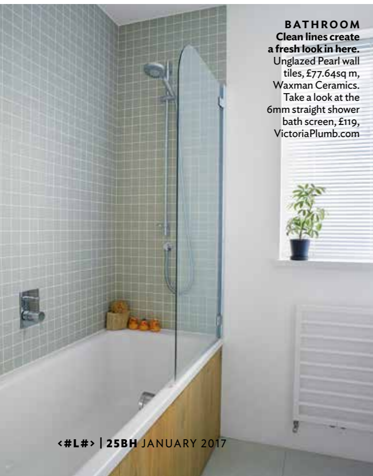
BATHROOM Clean lines create a fresh look in here. Unglazed Pearl wall tiles, £77.64sq m, Waxman Ceramics. Take a look at the 6mm straight shower bath screen, £119, VictoriaPlumb.com