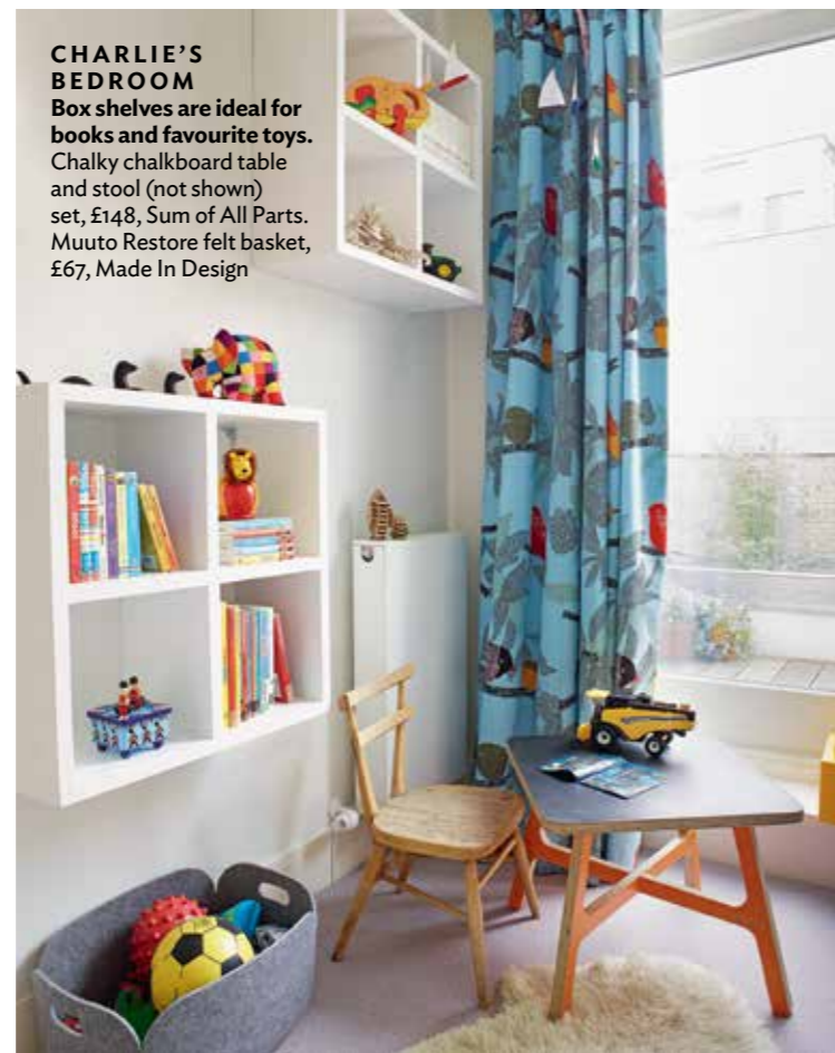
CHARLIE'S BEDROOM Box shelves are ideal for books and favourite toys. Chalky chalkboard table and stool (not shown) set, £148, Sum of All Parts. Muuto Restore felt basket, £67, Made In Design